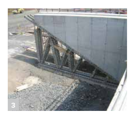
Load capacity of up to 100 kN - concrete pressures up to 80 kN/m<sup>2</sup>