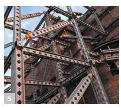
Economical and adaptive use allowing horizontal, vertical or inclined connection, e.g. in facade retention